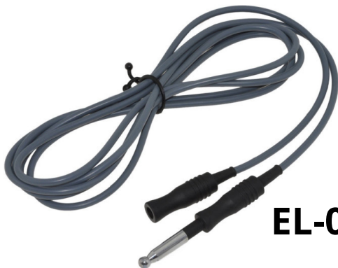
Mono Cable, 4.8mm Skt, 3M, 4mm Pin

Manufactured in accordance to the requirements of BS EN ISO 60601- 2-2: 2009. In 3 metre lengths