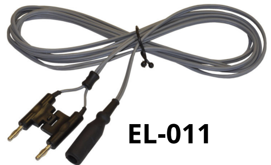
Bip. Cable, Euro Fcp, 3M Twin 4mm Pin fixed pitch